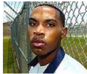
Genarlow Wilson Freed

Transparency requires enhanced accountability and information dissemination!